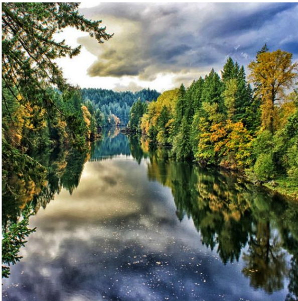
The Clackamas River wends through scenic Milo McIver State Park.

Kayakers, disc golfers, anglers, equestrians: They all believe Milo McIver State Park , 45 miles southeast of Portland, was made just for them.